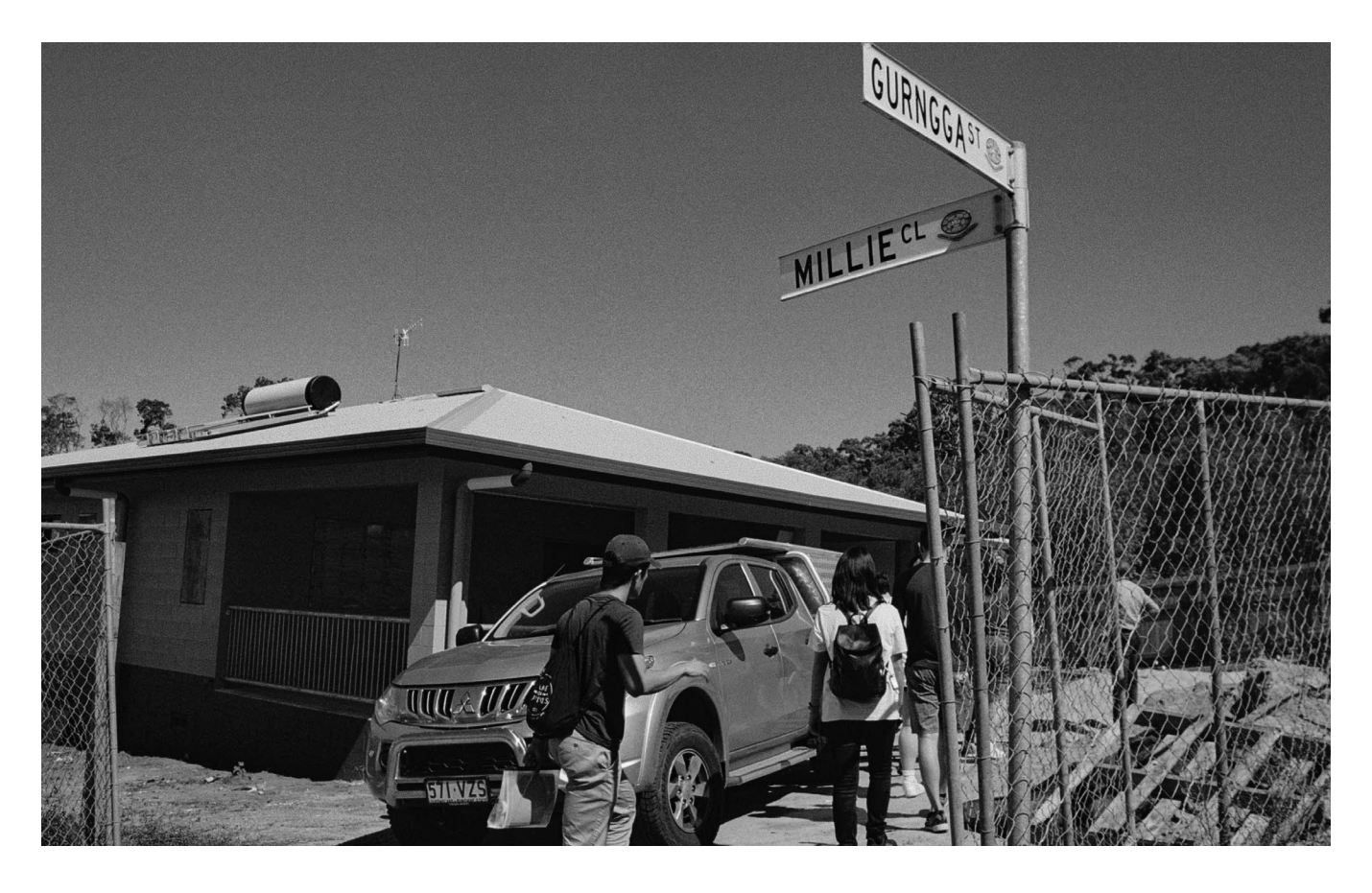
Figure 7. Students speaking with construction and housing providers in community about the delivery process

couch table. Focus on how your values identified in your story map, contribute to this space? How do they present in your home? Demonstrate these values in your drawing. Beyond shelter and refuge, what makes this home yours?