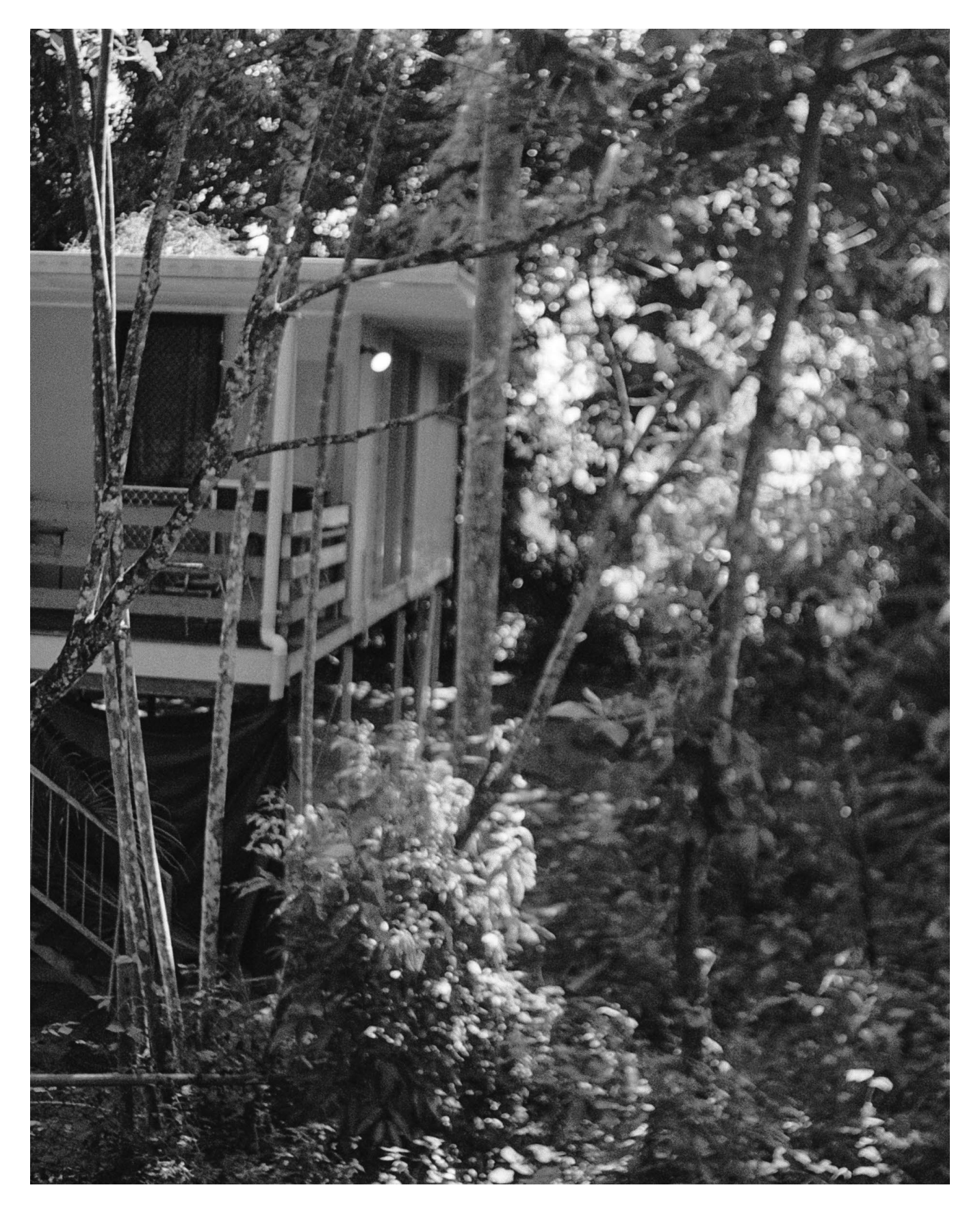
Figure 4: Walking down the street facilitates a unique exploration of the housing typology within community, image: Anna Ewald-Rice