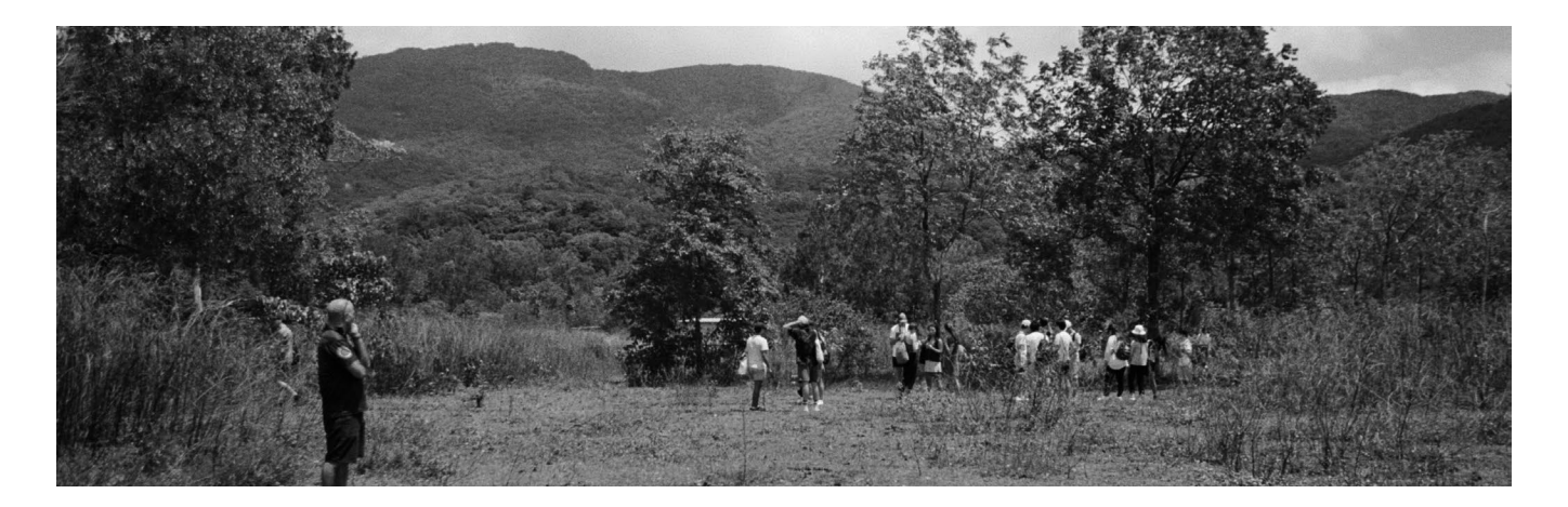
Figure 8. One of the authors supervising on site as students experience the local tropical environmental conditions, image: Anna Ewald-Rice

culturally inappropriate solutions with devastating national health, education, and wellbeing implications.