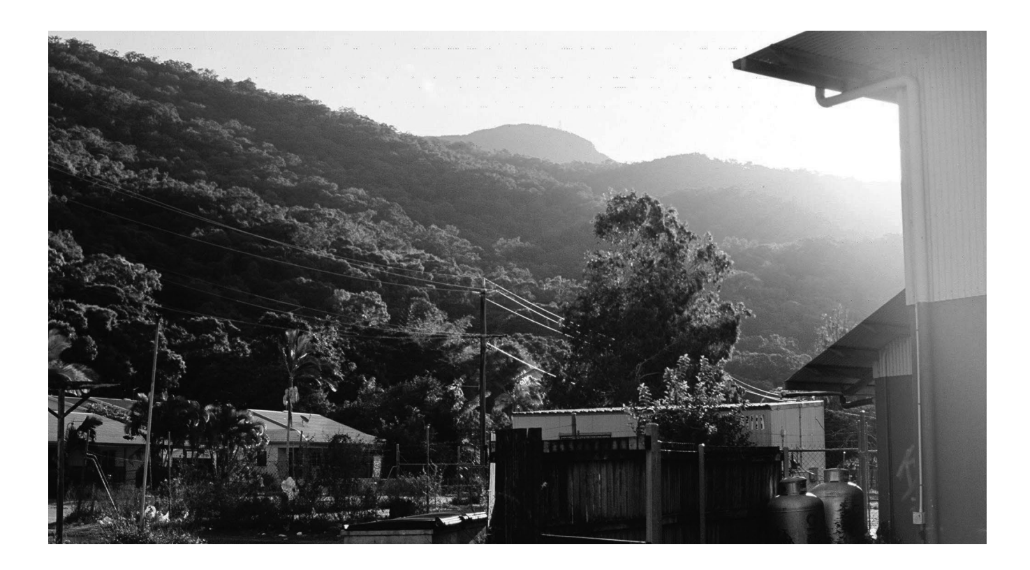
Figure 1. Encouraging students to develop sensitivity to the specific cultural needs and values of this unique tropical Indigenous Australian community, image: Anna Ewald-Rice

An examination of the indigenous map of Australia demonstrates diversity, difference, multiplicity and many cultures existing upon the island continent. The boundaries are fluid yet distinct, blurred yet understood through learning and experience. In contrast to these soft non-cartesian edges, the current map of Australia outlines a federation of Colonial States, forming a Commonwealth Nation claimed by the British Crown. These binary boundary conditions could be described as smooth and striated. Smooth as means of describing traditional methods of acknowledging, understanding and living with space. Striated as a method of overlaying cadastral information over space regardless of how it impacts the terrains of land and sea. It is important for students to consider that both conditions can coexist in all their multiplicity of forms.