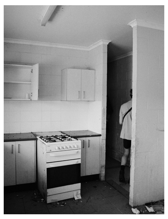
Figure 6. Students experiencing housing conditions first hand, image: Anna Ewald-Rice

—Martin Nakata, Disciplining the Savages, Savaging the Disciplines